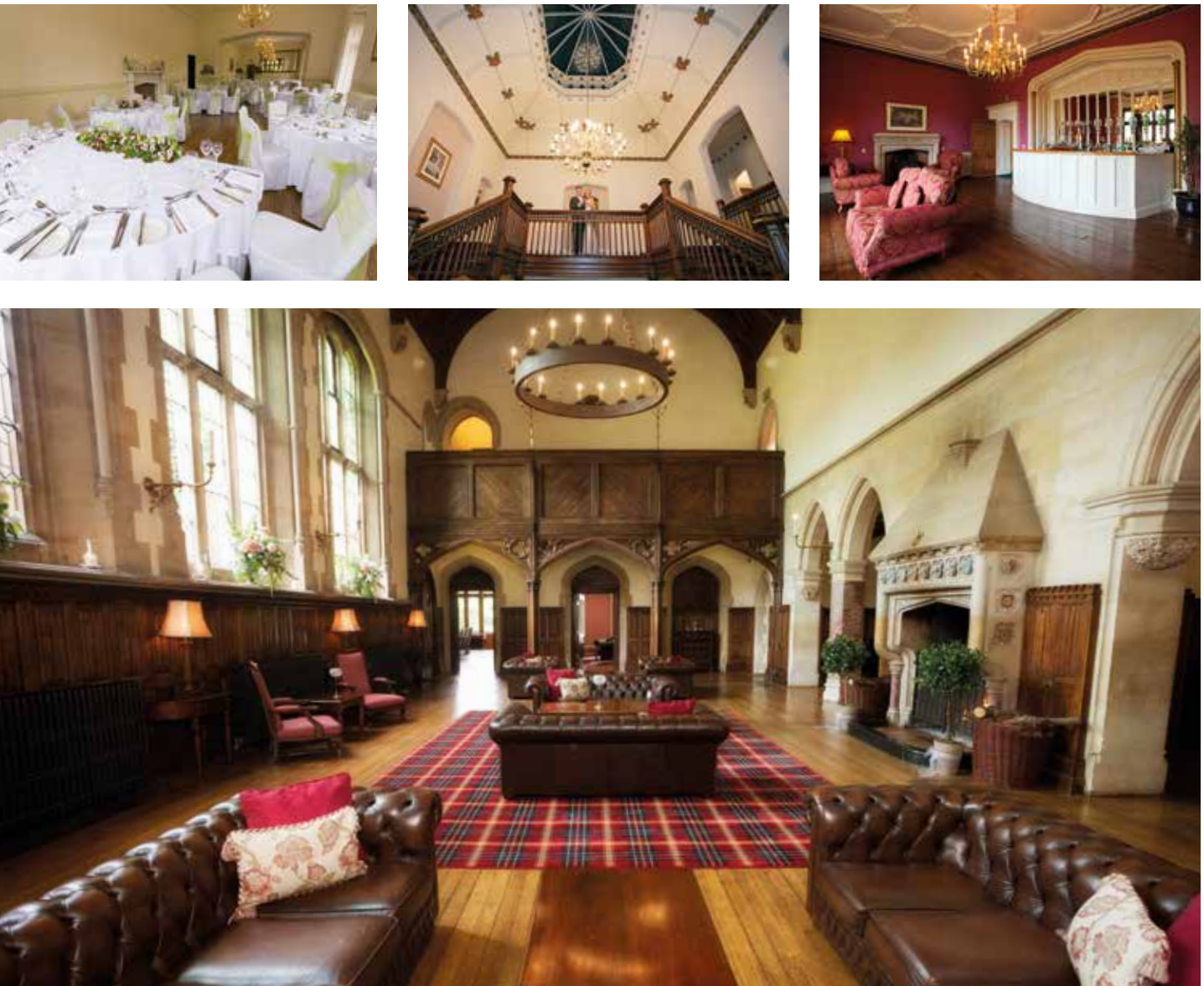
Warmly welcome guests with a roaring log fire in the Great Hall with a drinks reception or relax in the gilded Drawing Room. The latter has its own baby grand piano and famous ornate ceiling known as the Burst of Angels. The cosy Champagne Bar and newly refurbished disco can host up to 250 guests for an evening party.