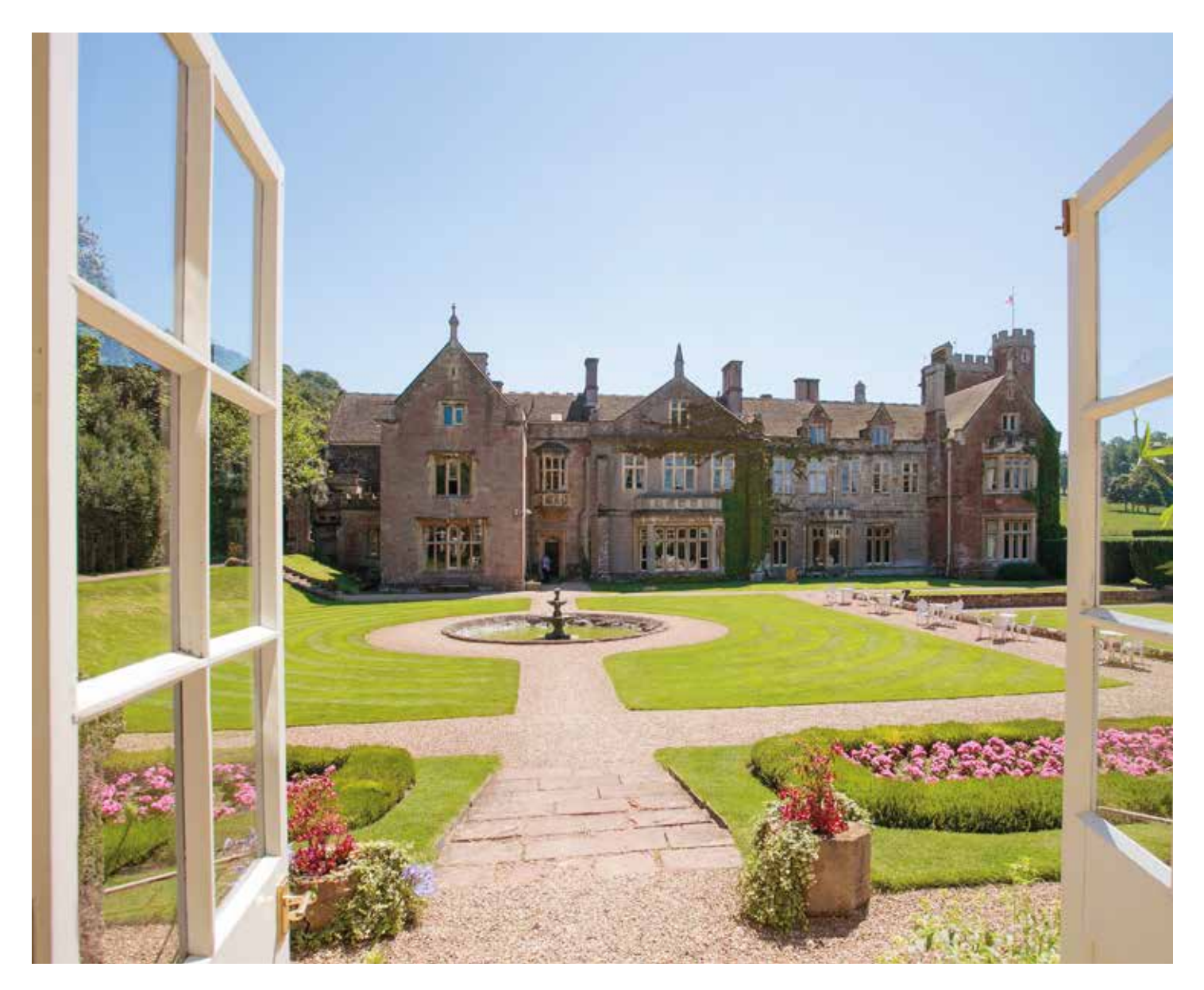
With a sloping landline, it's ideal for capturing the stunning natural landscape in every one of your photographs. More than that, St Audries boasts a number of unique spots for your pictures whatever the season. In Summer, the sun reflects the turrets on the mirrored lake whilst the ivy on the house turns a vibrant shade of red in Autumn.

In warmer weather, serve drinks around the pretty fountain on the manicured lawn between the Orangery and the main house. Guests can try their hand at croquet or look out for one of the resident deer which roam the park.