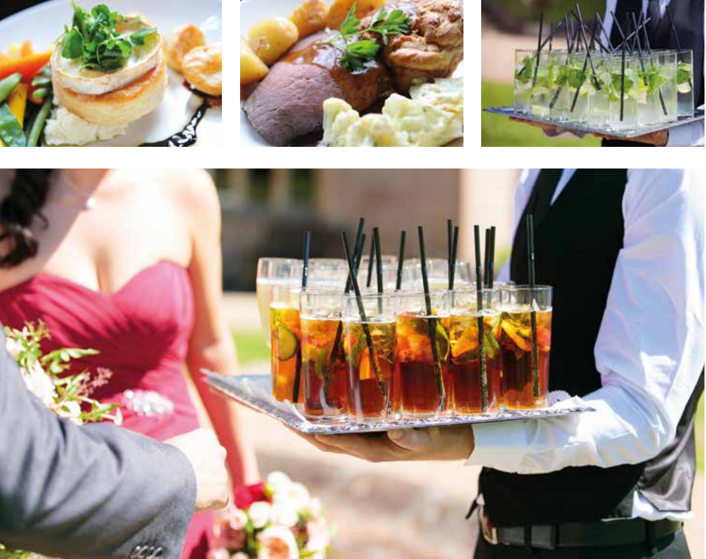
From four-course gourmet meals to irresistible buffets which will delight evening guests, we promise delicious food served impeccably. Enjoy regional cheeses and locally grown vegetables, alongside herbs from our own garden, in creative canapés and mouthwatering mains. For something a bit different, tuck into an evening hog roast or meat skewers from our alfresco barbeque grill.